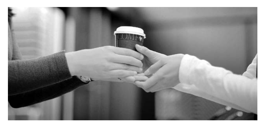
"Bring all the tithes into the storehouse so there will be enough food in my Temple. If you do," says the Lord of Heaven's Armies, "I will open the windows of heaven for you. I will pour out a blessing so great you won't have enough room to take it in! Try it! Put me to the test!" Malachi 3:10 NIT